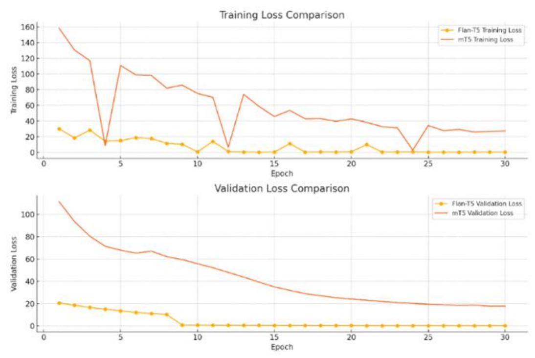
Figure 5. Graphic Model Test Results

This finding aligns with [20], [26] who demonstrated the strength of the T5 framework in handling a wide range of text generation tasks with efficient training convergence. Furthermore, similar to the observations [49] on the advantages of ROUGE in text summarization evaluation, Flan-T5's high ROUGE scores confirm its reliability in producing coherent and relevant summaries. However, mT5's limitations in this specific context reflect findings [23], [50], which suggests that while multilingual models like mT5 or their regional adaptations are effective in multilingual or domain-specific settings, they often require further fine-tuning to reach optimal performance in high-quality text generation tasks. Additionally, [51], [52] emphasize the challenges multilingual transformers face in handling long or complex sequences effectively, which could explain mT5's lower performance compared to the more specialized Flan-T5 model in this evaluation. Therefore, this study supports previous research while highlighting FlanT5's superior efficiency and quality in text generation tasks.