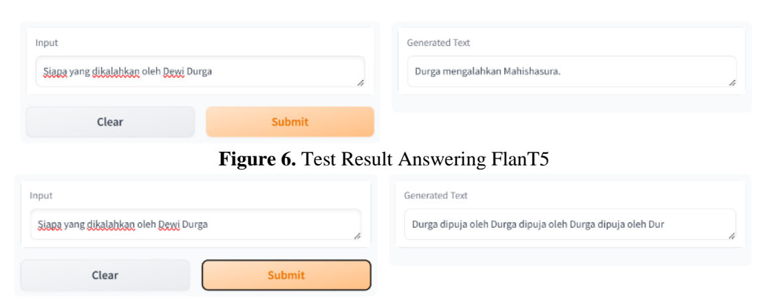
Figure 7. Test Result Answering mT5

in stable learning. Even as mT5's validation loss gradually decreases, it remains significantly higher than Flan-T5's, underscoring Flan-T5's superior efficiency and reliability in the training process. These findings align with who found that the T5 framework is designed to optimize transfer learning capabilities, resulting in more stable and efficient training processes. Similarly, it is observed that models designed with single-language optimization often yield more consistent learning curves and lower validation losses, as seen with Flan-T5 in this evaluation