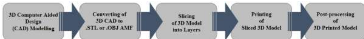
Figure 2. Five (5) general steps in 3D Printing

The 3D printing process starts with a 3D model which could either be made using a Computer-Aided Design (CAD) software or by 3D object scanners. The 3D model is then converted to a file format such as .STL, .OBJ, etc., and is then processed in a slicing software where the different parameters such as printing speed, layer thickness, infill density are configured [18], [19], [20], [21]. The slicing software is also used to convert the .STL file into a G-code, which the 3D printer uses to create a 3D-printed object [21]. After printing, the part will then be removed and post-processed, and will then be prepared for application [19]. The figure below shows the whole process of 3D Printing.