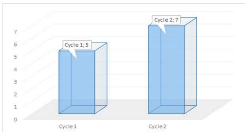
Figure 2. showed a great improvement in students' speaking skill between the first and second cycle.